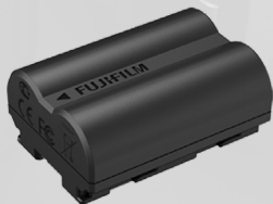
LI-ION BATTERY NP-W235 MSRP: $100