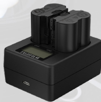
DUAL BATTERY CHARGER BC-W235 MSRP: $100