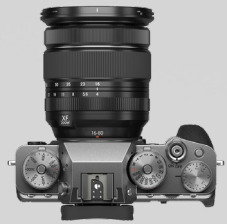
XF16-80MMF4 R OIS WR MSRP: $2900