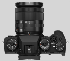
XF18-55MMF2.8-4 R LM OIS MSRP: $2700