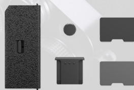
COVER KIT CVR-XT4 MSRP: $14.50