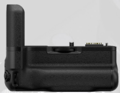
VERTICAL BATTERY GRIP VB-G-XT4 MSRP: $430