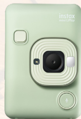
INSTAX MINI LIPLAY MSRP: $229