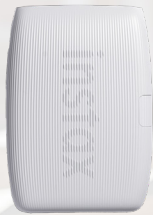
MINI LINK 3 MSRP: $129