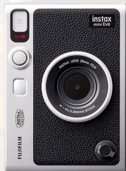
INSTAX MINI EVO MSRP: $249