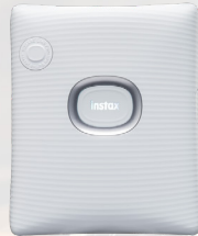
SQUARE LINK MSRP: $179