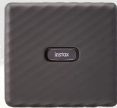
LINK WIDE MSRP: $189